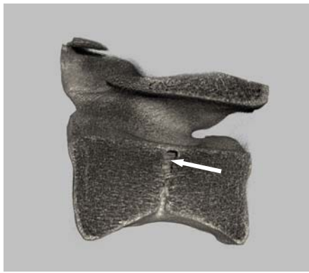
Figure 2: A 3D reconstructed image of a lumbar vertebra showing the L4 nutritional foramen of a mature sheep (white arrow).

Figures 3 and 4 show the defects created in sheep mature lumbar vertebrae (L6). Dataset scan images and 3D reconstructed images clearly indicate that the defects are interconnected and reproducible defects were achieved.