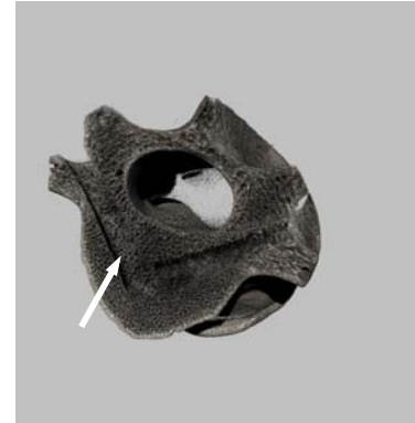
Figure 4: A 3D reconstructed image of a lumbar vertebra (L6) from a mature sheep showing the body defect (white arrow).