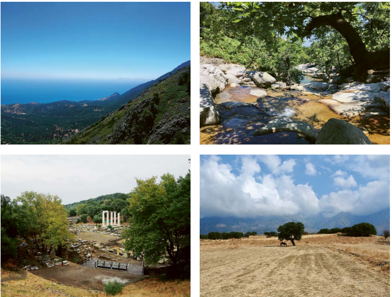
FIGURE 1: Images from Samothraki (clockwise, starting top left): north-eastern slopes of Saos mountain range, the Fonias river upstream, western agricultural planes, Sanctuary of the Great Gods.

ible and adaptable potential of island societies in the context of today's global challenges (Pugh and Chandler 2021). Islands' spatial, ecological and social boundedness urges local communities to act on environmental and socioeconomic challenges more than in mainland contexts – this makes them interesting focal points in a wide range of disciplines (Chertow et al. 2013). Islands have proven to be excellent sites for marine and coastal socioecological research (e.g., Glaser et al. 2018, Boyle et al. 2021) and offer chances for “revitalizing and innovating sustainable human-nature relationships” (Kueffer and Kinney 2017, p. 311).