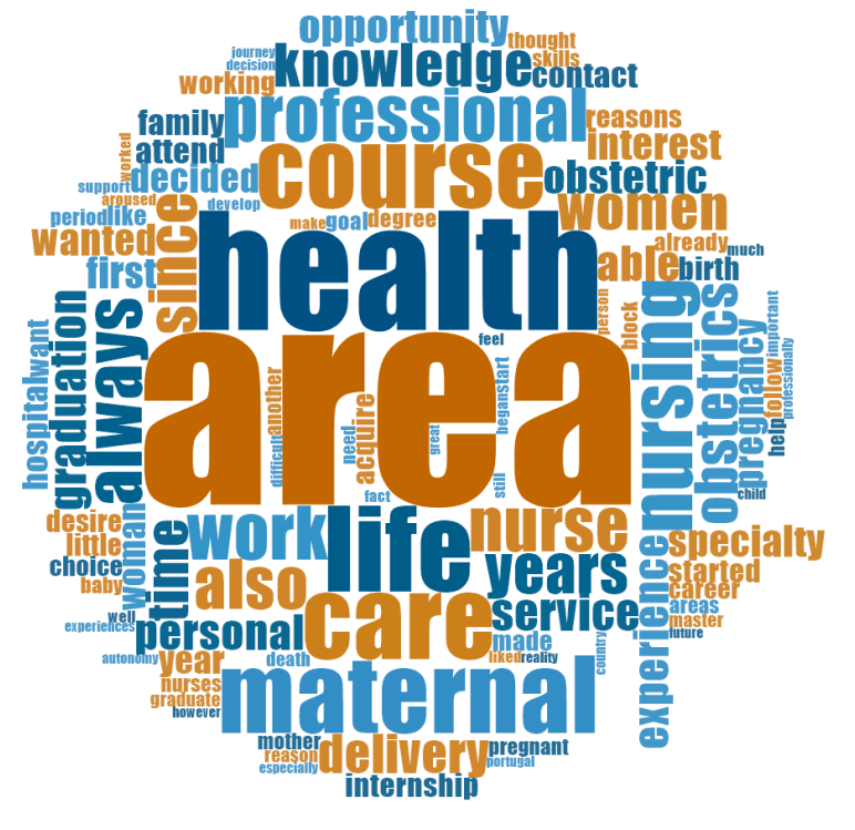
Figure 2. Word cloud.