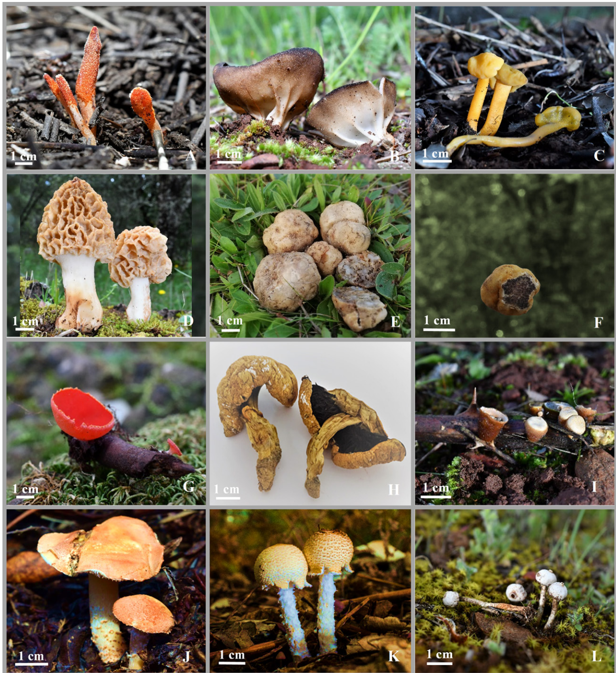
Figure 3. A. Cordyceps militaris (L.) Fr.* B. Helvella acetabulum (L.) Quél.* C. Leotia lubrica (Scop.) Pers.* D. Morchella esculenta (L.) Pers.* E. Terfezia extremadurensis Muñ.-Moh., Ant. Rodr. & Bordallo* F. Terfezia pini Bordallo, Ant. Rodr. & Mohedano* G. Sarcoscypha coccinea (Gray) Boud.* H. Agaricus lutosus F.H. Møller.** I. Crucibulum laeve (Huds.) Kambly* J. Cystodermella terryi (Berk. & Broome) Bellù.** K. Lepiota magnispora Murrill.** L. Tulostoma brumale Pers.* (* = newly recorded from Alto Alentejo Province; ** = newly recorded from continental Portugal)

Stipe whitish to brownish, finely hairy, deeply pocketed and ribbed; with sharp-edged forking ribs that extend onto the under surface of the pileus. Spores 16–20×11–14 µm, elliptical, smooth, with one central oil droplet. This relatively large cup-shaped fungus is characterized by a brownish ascocarp with prominent branching ribs, resembling a cabbage leaf. It can be confused with H. leucomelaena (Pers.) Nannf., which has a darker coloured pileus and a short stipe without ribs, and with Helvella queletii Bres., which has a well-developed ribbed stipe, but the ribs seldom extend past the base of the cup.