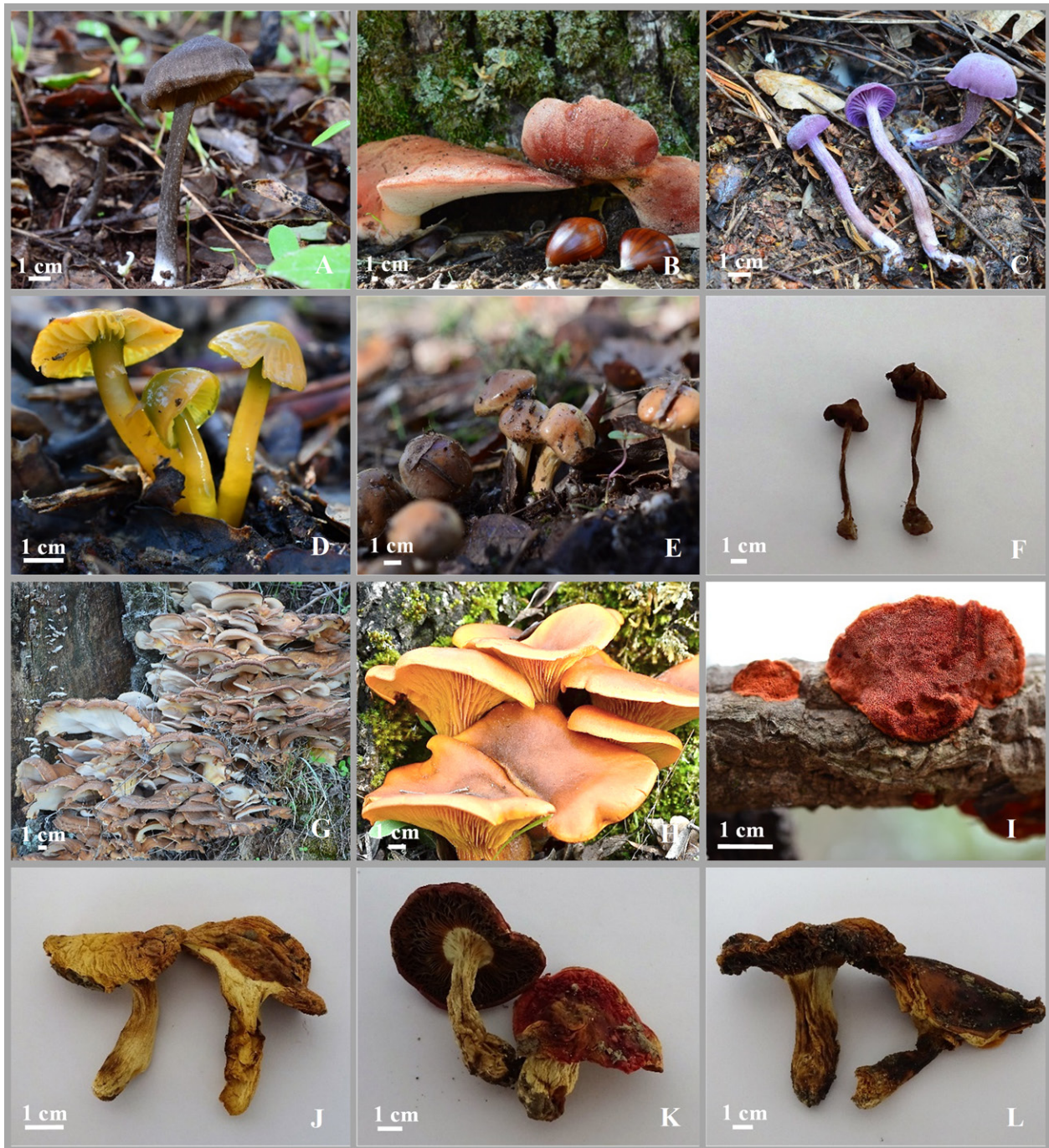
Figure 6. A. Entoloma hirtipes (Schumach.) M.M. Moser* B. Fistulina hepatica (Schaeff.) With.* C. Laccaria amethystina Cooke* D. Gliophorus psittacinus (Schaeff.) Herink* E. Hebeloma collariatum Bruchet** F. Incocybe acuta Boud.** G. Meripilus giganteus (Pers.) P. Karst.* H. Omphalotus illudens (Schwein.) Bresinsky & Besl** I. Pycnoporus cinnabarinus (Jacq.) P. Karst.** J. Russula farinipes Romell** K. Russula oreades Sarnari** L. Russula sericatula Romagn.**. (* = newly recorded from Alto Alentejo Province; ** = newly recorded from continental Portugal)

wavy margin; smooth, hygrophanous, viscous when wet, ranging from dark orange to dark red. Hymenium composed of crowded, yellowish pores, bruising cherry red. Stipe rarely present. Inonotus hispidus (Bull.) P. Karst. is similar but has a hairy or velvety upper surface and occurs in different habitats.