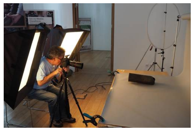
Documenting a collection of cowbells to be exhibited at Paço dos Henriques (Alcáçovas, Alentejo, south of Portugal), 2017.