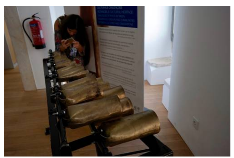
Cowbells exhibition at Paço dos Henriques (Alcáçovas, Alentejo, south of Portugal), 2016. The manufacture of cowbells was inscribed in 2015 on UNESCO List of Intangible Cultural Heritage in Need of Urgent Safeguarding. The Portuguese cowbell is an idiophone percussion instrument with a single internal clapper, usually hung on a leather strap around an animal's neck. It is traditionally used by shepherds to locate and control their livestock, and creates an unmistakable soundscape in rural áreas.

Intangible heritage has become a buzzword nowadays, in part due to the visibility of the <u>UNESCO Convention for the Safeguarding of Intangible Heritage</u> (2003), which called our attention to the need of giving awareness to a living heritage, in constant modification, that is part of the identity of groups and communities and is transmitted from generation to generation.