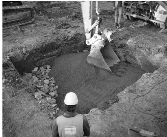
Figure 3. Cyclopean concrete at the pad footing basement.

Engineers decided to replace the “weak soil” below 4,0 m in the footing area by cyclopean concrete (Fig. 3) and then made pad footings of 2,0 m thickness.