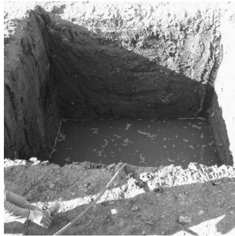
Figure 2. Fill and water table detected during excavations.

During the excavation works for the footings, in situ observations pointed out a 7,0 m thick fill and a water table at 4,0 m depth (Fig. 2). This situation led to changes in the foundation design.