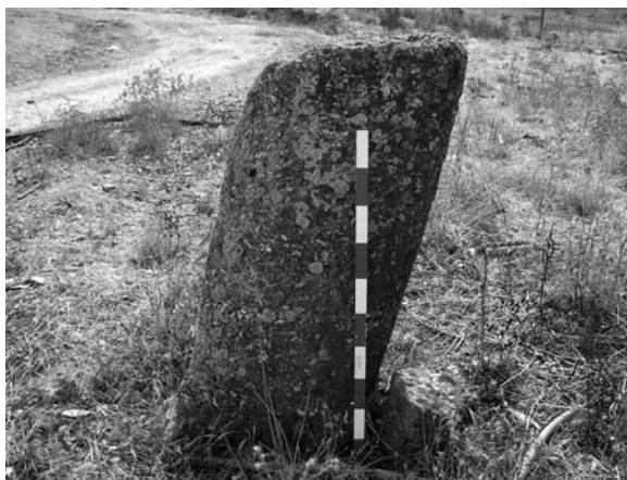
Fig. 3. Monte da Coreia (Ponte de Sor, Portugal), milestone found in situ on route XIV.