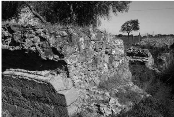
Fig. 2. Ponte de Nossa Senhora da Enxara (Campo Maior, Portugal), over the river Xévara on route XV (nº21)-