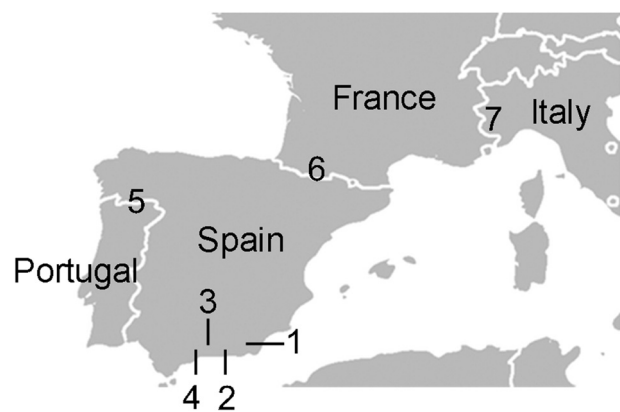
Figure 1. Distribution of the study sites. 1: Sierra Nevada Natural Space for Capra pyrenaica hispanica ; 2: Sierra Mágina for C. p. hispanica ; 3: Sierras de Tejada y Almajara for C. p. hispanica ; 4: Sierra de Loja for C. p. hispanica ; 5: Sierra Sur de Antequera for C. p. hispanica ; 6: Parque Nacional de Peneda-Gerês – Baixa Limia and Serra do Xurés Natural Park for Capra pyrenaica victoriae ; 7: Parc National des Pyrénées for Rupicapra pyrenaica ; 8: Parco Naturale Val Troncea for Rupicapra rupicapra and Capra ibex .

We used data from 21 field surveys carried out between 1995 and 2012 in the Parc National des Pyrénées (PNP), France, for Pyrenean chamois; Parque Nacional de Peneda-Gerês – Baixa Limia and Serra do Xurés Natural Park (PNPG), two adjacent and contiguous areas in northern Portugal and northwestern Spain, respectively, Sierra de Loja (SL), Sierra Sur de Antequera (SSA), Sierra de Tejada y Almajara (STA), Sierra Mágina (SM) and Sierra Nevada Natural Space (SN), southern Spain, for Iberian ibex, and Parco Naturale Val Troncea (PNVT), western Italian Alps, for Alpine chamois and Alpine ibex (Figure 1, Table I). These surveys accounted for a total of 1919.7 km of walked transect. The surveys were designed to sample at least 10% of the study surface area and transects were placed using a stratified sampling design (regarding orientation, slope, height and type of vegetation). For details in survey design, see Palomares and Ruiz-Martínez (1993) and Pérez et al. (1994). In Table I, we indicate the date (month and year) in which each survey was performed. Transects were sampled from 07:00 to 10:00 and