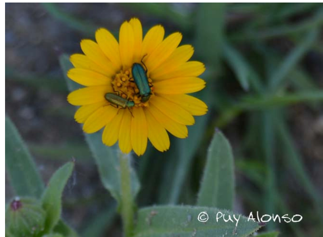
Figure 8.- Insects from the family Melyridae on Calendula arvensis