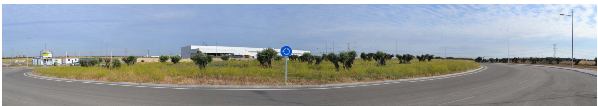
Figure 6.- General view of the roundabout. The dominant colour is the yellow of Calendula and Diplotaxis (May 2014).