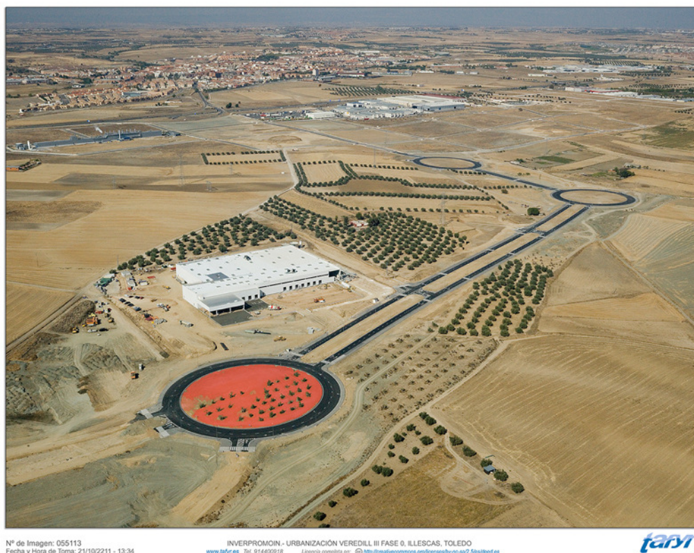
Figure 3.- Aerial photograph.

The second case study presented is the experimental sowing of a roundabout in a new industrial development to the east of the town of Illescas, on the border with the municipality of Yeles (Toledo). The roundabout measures nearly 6,000 m 2 with olive trees transplanted from neighbouring plots on half of this area.