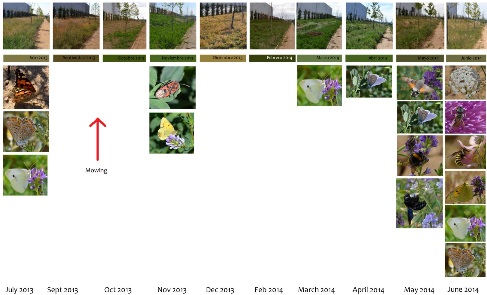
Figure 2.- Evolution of the meadow and the presence of insects