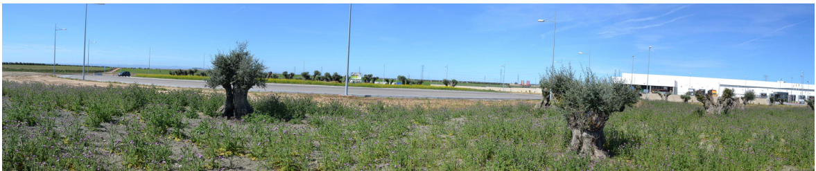
Figure 5.- View of the olive grove adjacent to the roundabout (in the background) dominated almost exclusively by thistles ( Carduus bourgeanus ) (May 2014).

In the floral inventory, carried out in May 2014, in comparison with the adjacent olive grove, where thistles cover the whole area, a remarkably large number of species were identified on the roundabout plot.