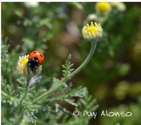
Figure 7.- Coccinella septempunctata on Matricaria arvensis

The presence of pollinators or small insects is unsurprisingly limited to these months of flowering (April-May), establishing the presence of bees, ladybirds and other beetles but few butterflies, possibly due to the frugality of flowering.