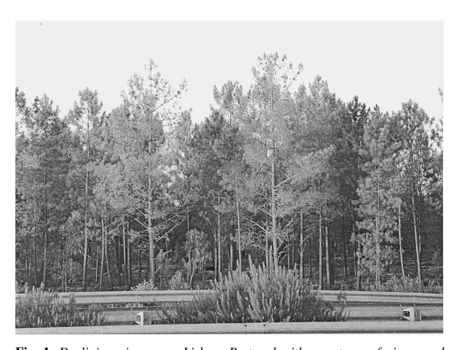
Fig. 1. Declining pines near Lisbon, Portugal with symptoms of pine wood nematode infertation.

wilted pines. For a more detailed description on this subject, see Mota (2002). The discovery was a result of a joint research effort between the University of Évora and the research organisms of the Ministry of Agriculture of Portugal (INIA/EAN and EFN). Following detection, the Portuguese authorities promptly informed the European Union (EU) of the presence of pine wood nematode, in mid-1999. A task force (GANP) was immediately established, followed by a national programme of survey and control of the pine wood nematode (PROLUNP) (Serrão, 2001). From 1999-2001, several EU phytosanitary inspection teams have been able to verify the results of the PROLUNP actions. The nematode has been shown to be contained in the Setúbal peninsula, approximately 30 km south east of Lisbon, where symptoms may be occasionally observed (Fig. 1).