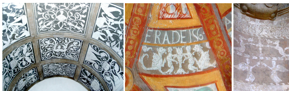
FOTO: S. João Batipsta (Amieira), Nossa Senhora da Redonda (Alpalhão) and Nossa Senhora do Rosário (Idanha-a-Velha).

In the Chapel of Nossa Senhora da Redonda, in Alpalhão, the sgraffito, from 1564, appear together with a mural painting, with subjects of fantastic animals, cherubim, figures half humane half floral. These sgraffito have some similarities, in the iconographic program, as well as in the technique, (both with sand mortar in the background), with the sgraffito, from 1593, with that decorates the covering in shell of the Chapel of Nossa Senhora do Rosário, in the called "Cathedral" of Idanha-a-Velha, with geometric motifs that border the date and a more figurative motifs (zoomorphic, cruciform, and angel heads) in the wall above the shell covering of the Chapel of Nossa Senhora do Rosário, in the so called “cathedral” of Idanha-a-Velha.