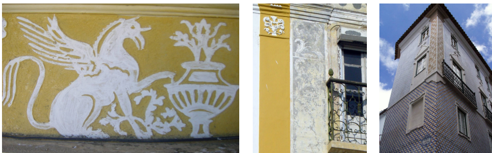
FOTO: Condes de Soure Palace, Luís de Camões Square and 5th de Outubro Street, in Évora

However, in Portugal, it is during the 18 th and 19 th centuries, in the “height of the urbane culture, that the technique of sgraffiting is used, in the learned and popular form, to explore all its communication potential, to express an aesthetic urbane intention of visual presentation and architectural communication 6 . This urbane culture integrated, assimilated and adapted decorative elements, techniques and earlier construction practices, (re)applying and (re)interpreting previously used drawings, such as the winged horses in the Palace of the Condes de Soure and in the Rua Vítor Pereira do Monte, in Évora, of the lily flower in the Rua do Menino Jesus, and the fish with coils in the Rua dos Três Senhores, also in Évora.