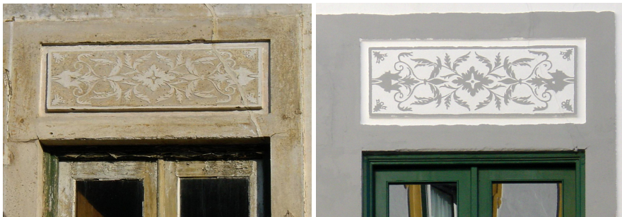
FOTO: before and after the intervention

Many of these actions of painting corrupt and alter the image of the building and of the urbane set and transformed, for example, the city of Evora into a white and ochre city, despising all his previous chromatic wealth. .