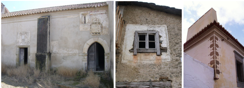
FOTO: Juromenha, Montesinho and Monsaraz

The recently restored circle based geometric composition in Casa da Inquisição (Monsaraz) is far less usual. These themes have always been used, both in erudite and in popular examples, for a very long time, and thus are not characteristic of a particular period or artistic style.