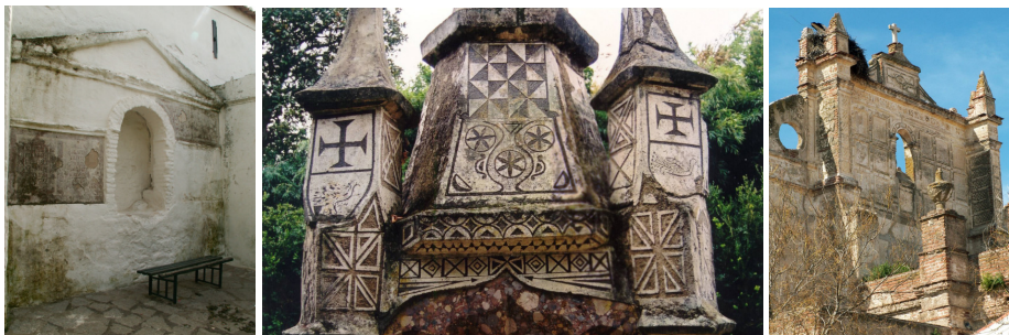
FOTO: Vale de Vargo (Serpa), Quinta da Amoreira da Torre (Montemor-o-Novo) and Safara (Moura)

In posterior façade of the Paço da Sempre Noiva, near Arraiolos, it was possible to see a sgraffito decoration with wide bars, with styled foliage, embellishing chimneys, windows and cornices. The background is sand coloured and the motifs are white coloured. In 1997, we could recognize the sgraffiti, among other masonry simulation techniques. This façade provided a lot of historic information on the technique and the making of this type of mortars with limestone decorations.