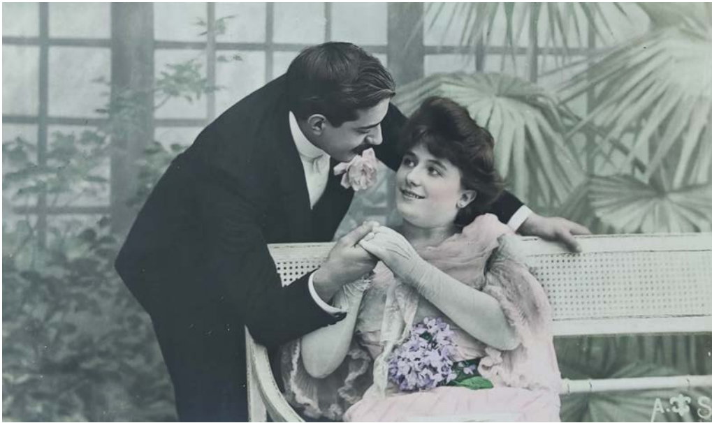
Figure 19. Couple of lovers holding hands over a violet bouquet (c. 1905).