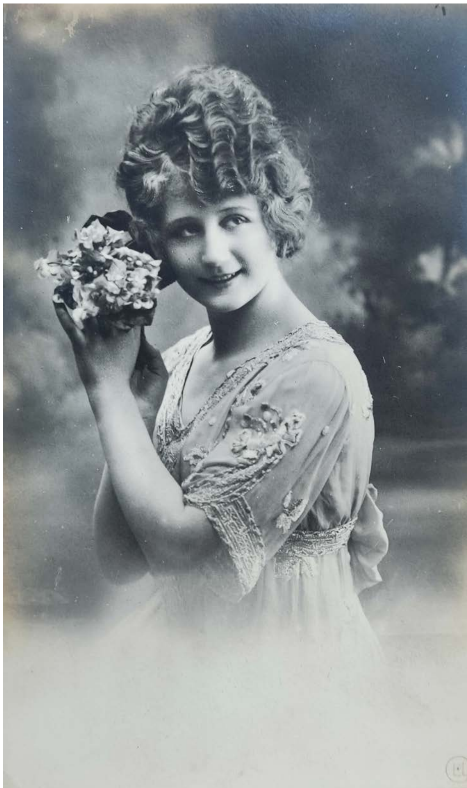
Figure 24. Woman holding several bouquets of violets (c. 1910).