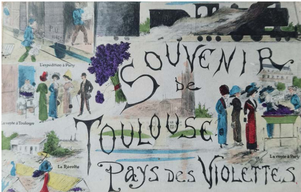
Figure 14. Souvenir postcard describing the main stages of violets' production and selling in Toulouse and their expedition to Paris (1919).