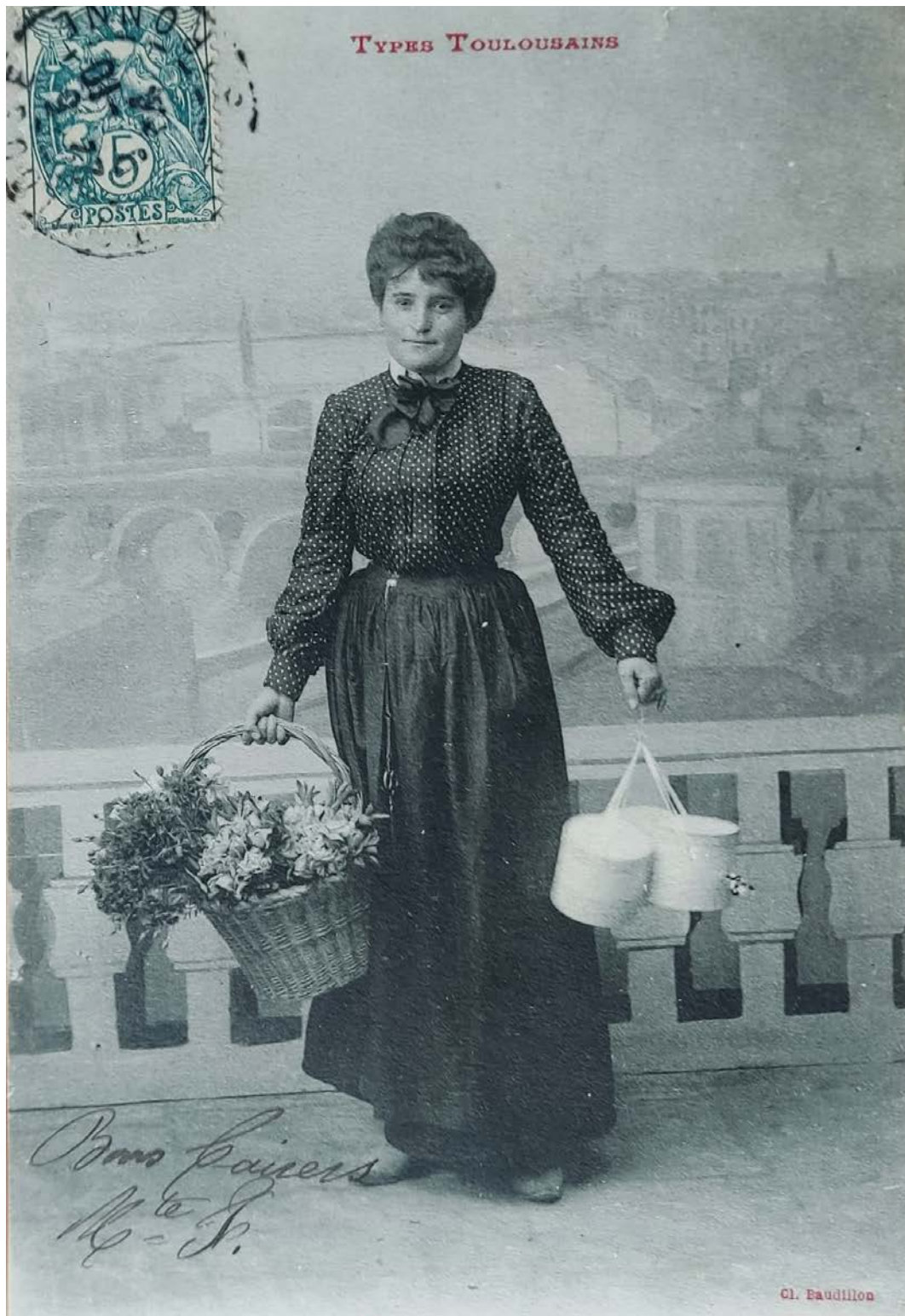
Figure 12. Seller of violets (in boxes), 'Types Toulousains – La Bouquetière' (1904).

The collection of Beja Botanical Museum has around 3000 photographs, half of which about violets – probably the world's largest photographic collection on these plants. The photographs selected to this essay represent cultural interaction between violets and women, not only in the harvesting (Figure 15) and selling (Figures 16-17) activities, also as receivers (Figures 18-21) and for personal use (Figures 22-28). In Memoirs of a Dutiful Daughter [ Mémoires d'une Jeune Fille Rangée 1958], a childhood and youth memoir of the French writer Simone de Beauvoir (1908-1986), the author recalls the daily return home of her father, in the early XX century Paris, and the use of violets in the domestic life: 'When he came back in the evening, he used to bring my mother a bunch of Parma violets, and they would laugh and kiss' (Beauvoir 2001).