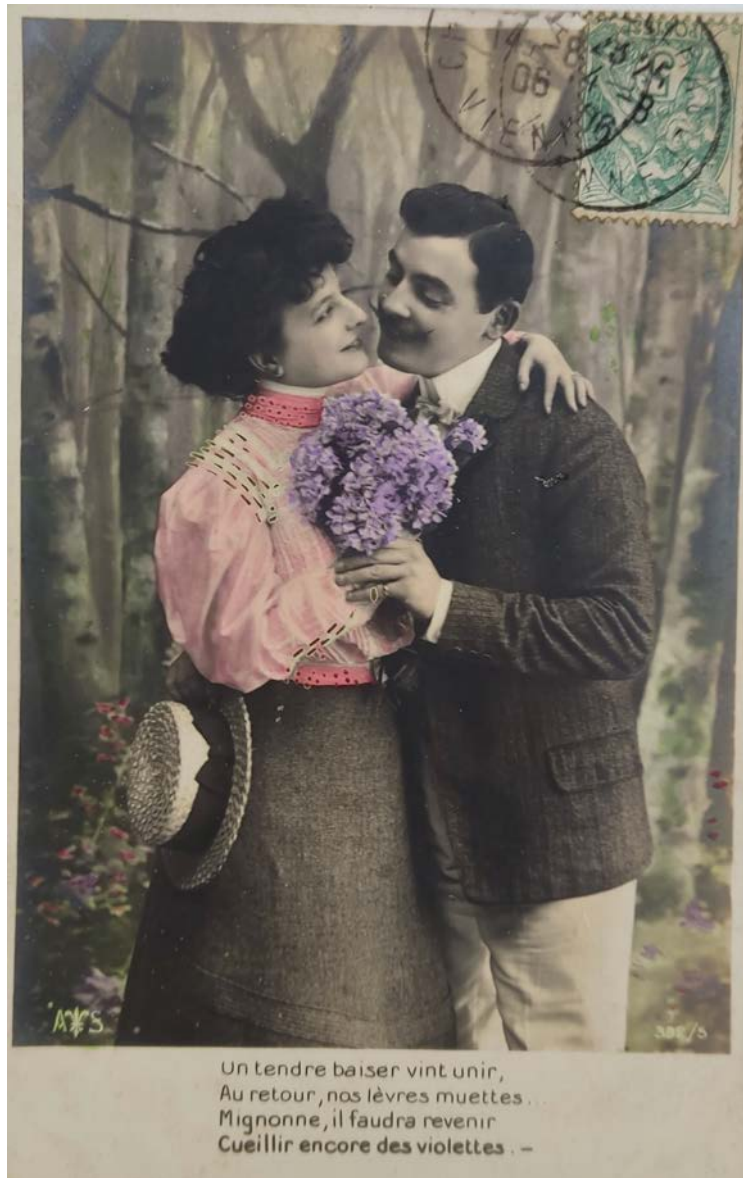
Figure 20. Couple of lovers holding bouquets of violets (c. 1910).