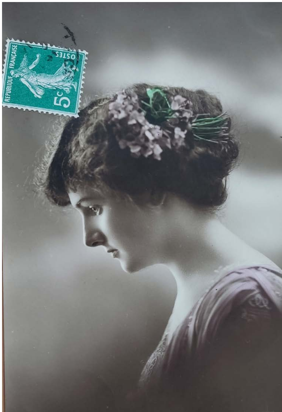
Figure 26. Woman wearing violets in the hair (c. 1910).