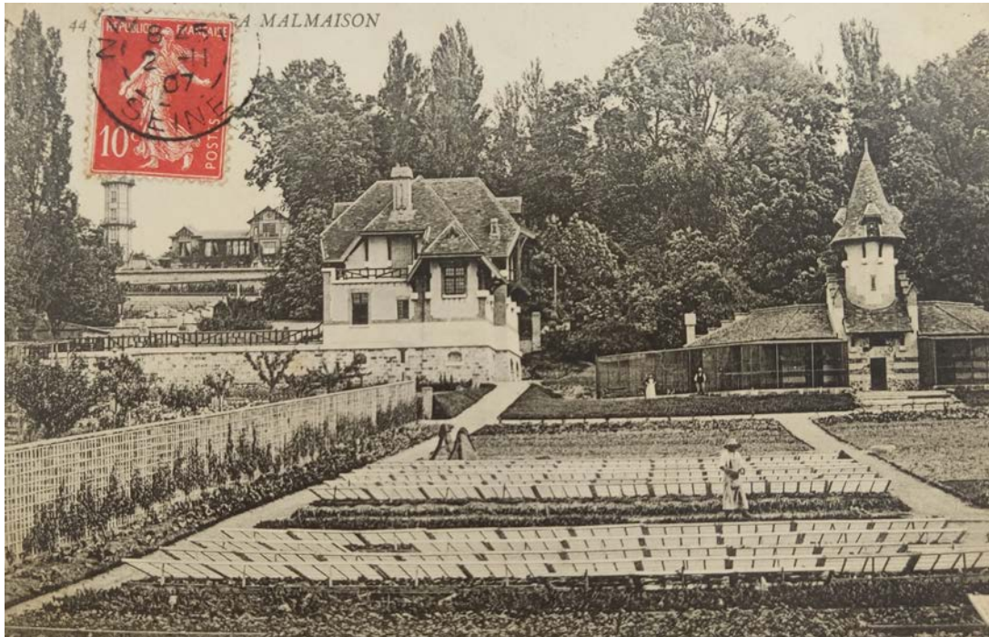
Figure 3. The park of the 'Château de Malmaison' (1907).