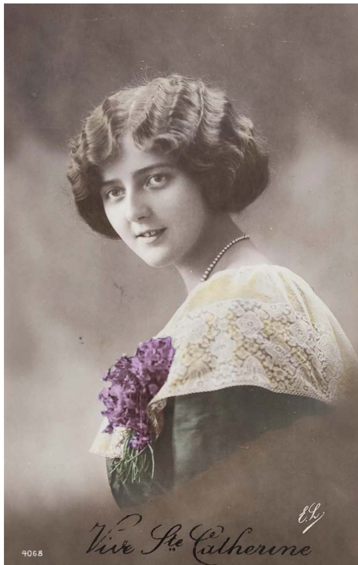
Figure 22. Violets' corsage (c. 1910).