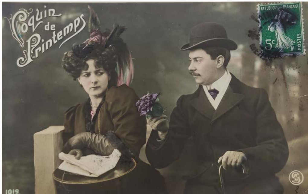
Figure 21. Man offering a violet bouquet to a reluctant woman (c.1905).