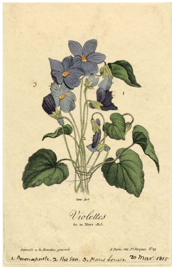
Figure 4. Violets of March 20 th (1815). Hand-painted print. A bunch of violets conceals the profiles of Napoleon, Marie Louise, and the King of Rome. Jean Dominique Étienne Canu. British Museum 1873,0712.906.