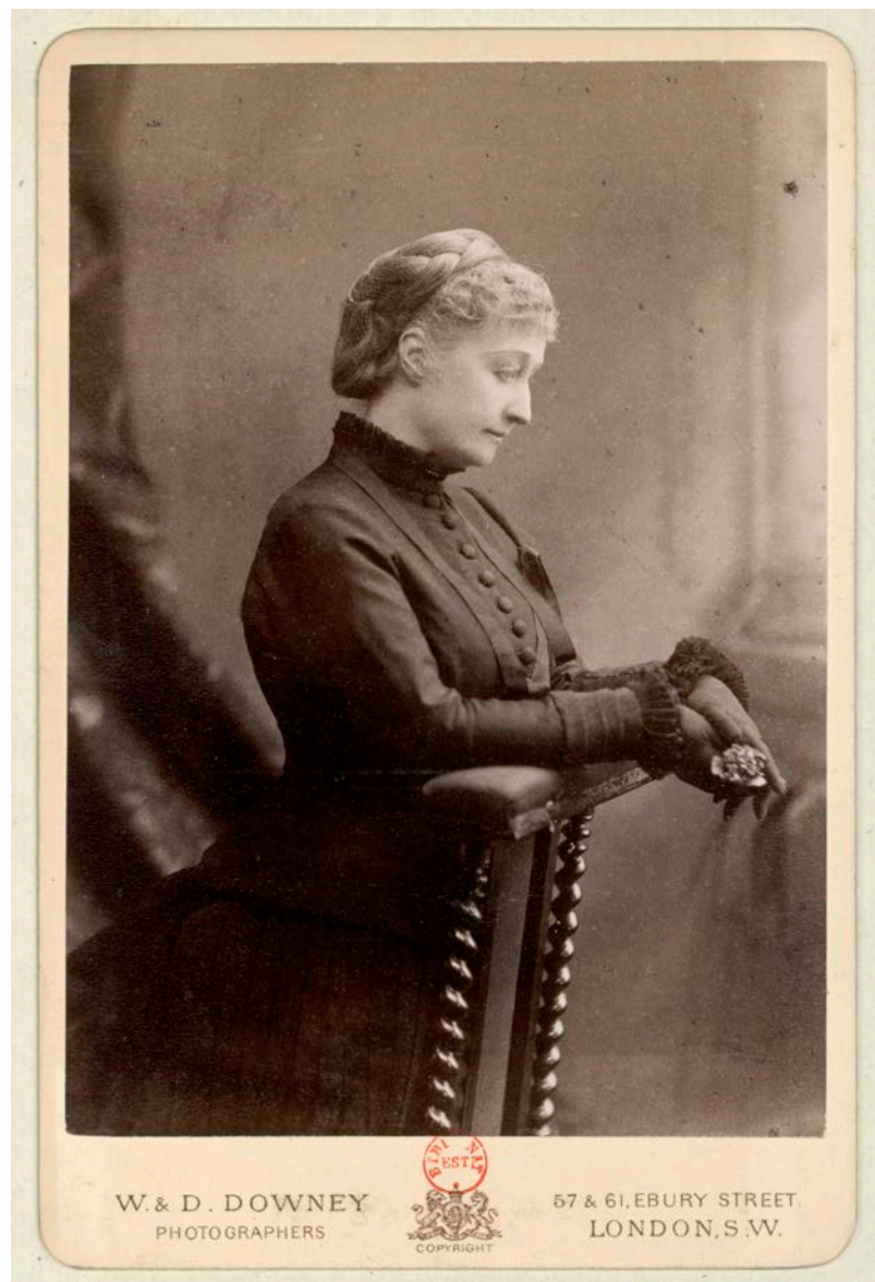
Figure 5. Empress Eugénie kneeling on a prie-dieu, with a bouquet of violets in her gloved hands (c.1880).