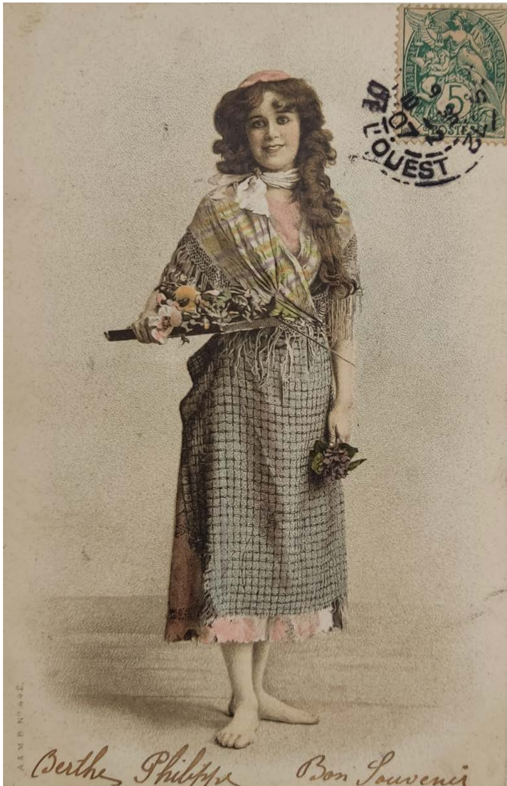
Figure 16. Selling violets (1907).