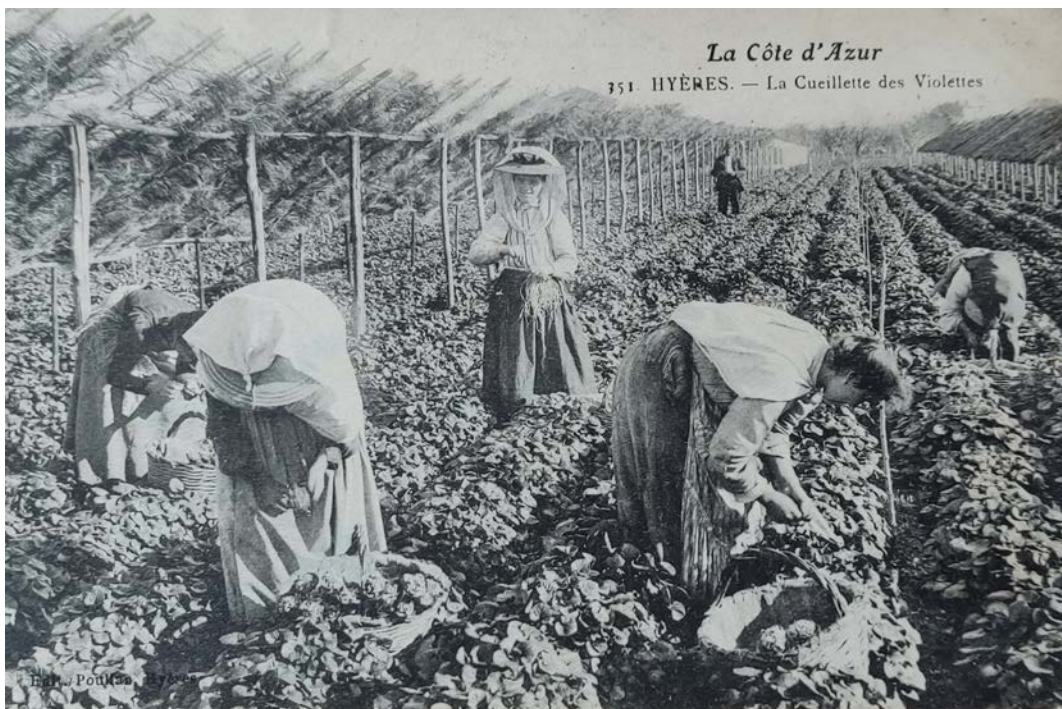
Figure 11. Picking violets in Hyères [La Côte de d'Azur] (1910).

The first record of Parma violets in Toulouse dates from 1854 and the centres of production were the villages of Lalande and Aucamville. The flowers were sold locally (Figures 12-13), and by the end of the nineteenth century, they were also sent, by train, to other major French cities, including Paris (Figure 14). Besides bouquets, Parma violets were used in local confectionaries to make the famous fin de siècle candied violets, which are still in production (Timbal-Lagrave 1862, Bertrand & Casbas 2001).