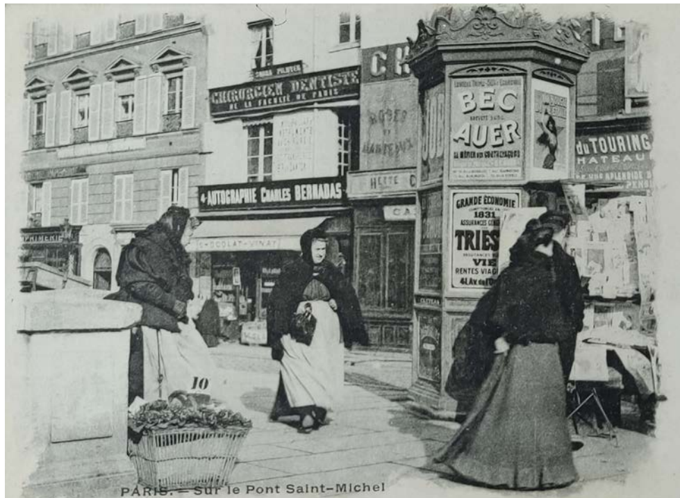
Figure 8. Selling violets on Saint-Michel bridge, Paris (c.1900).