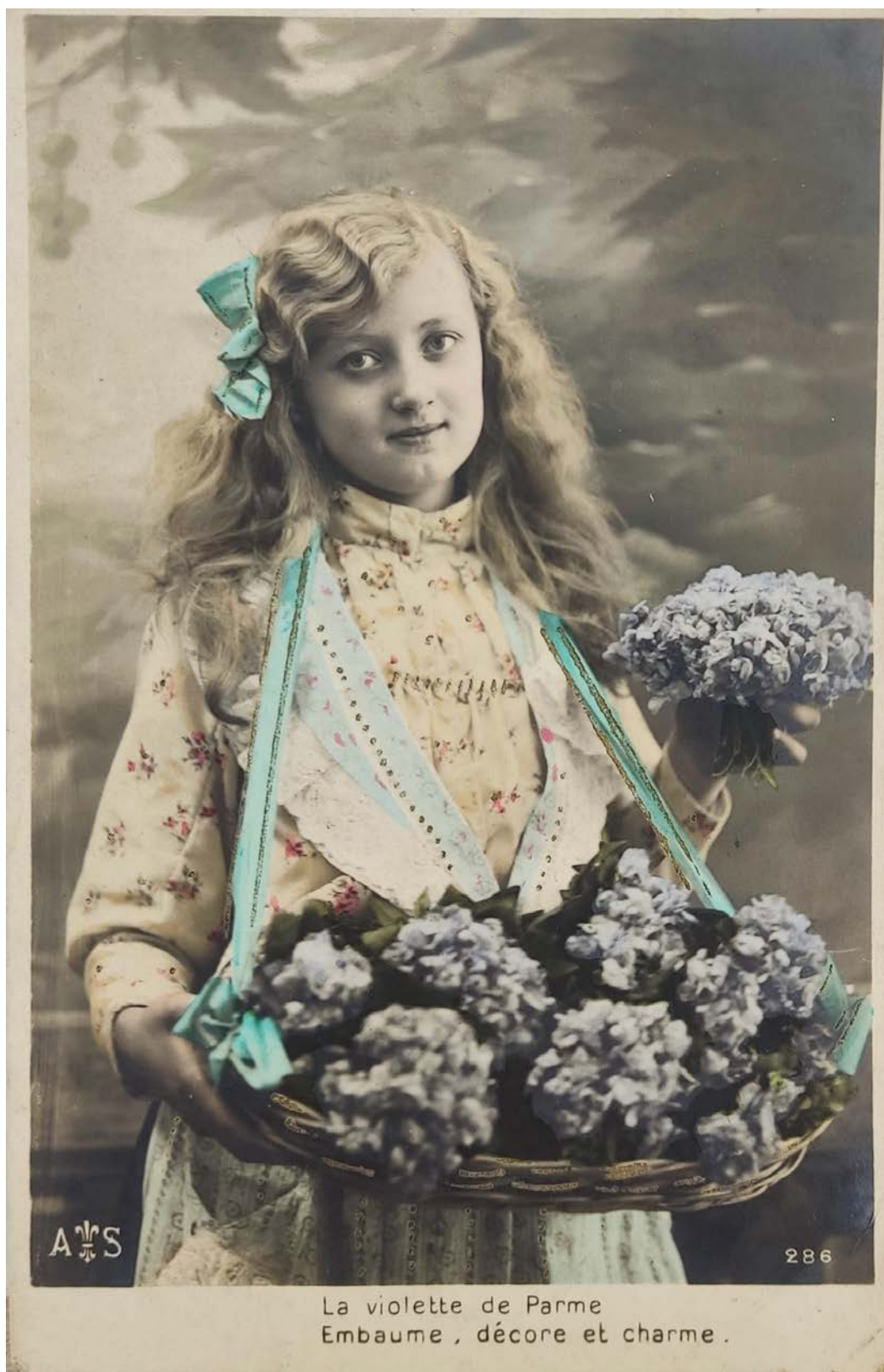
Figure 17. Selling violets (c.1910).