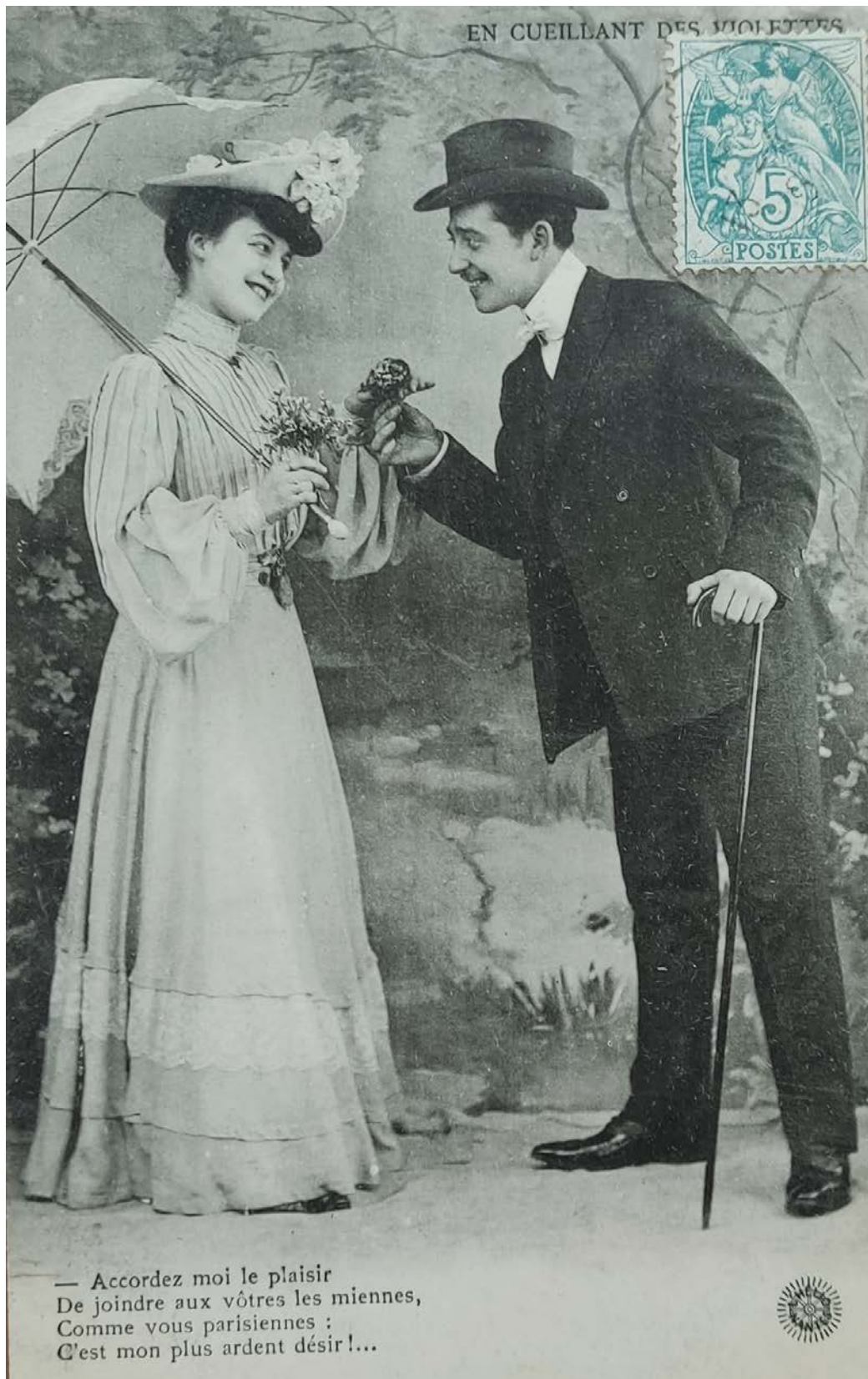
Figure 18. Couple picking violets [ En cueillant des violettes ] (1908).