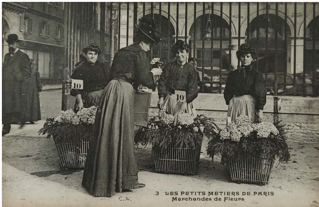
Figure 7. Violets sellers in Paris, ‘Les Petites Métiers de Paris – Marchandes de Fleurs’ (circa 1900).

Parma violets were cultivated in the many neighbourhoods of Paris, including Bourg-la-Reine, where was located the then famous nursery of Armand Joseph Millet (1845-1920). In 1898, describing the prominence of Parma violets in Paris, Armand Joseph Millet wrote: “everyone who has lived in Paris, even those who have merely passed through the city in March or April, have seen and admired those beautiful pots of violets which adorn our florist’s shops. All the covered markets and street markets are filled with them, flattering the eyes and filling the air of the metropolis with their sweet perfume. Well, it is the Parma violet again that supplies these quantities of plants.” (Millet 1898). It is estimated that, in Paris, by the end of the century, circa six million violets bunches were sold every year (Figures 7-9) (Perfect 1996, Coombs 2003).