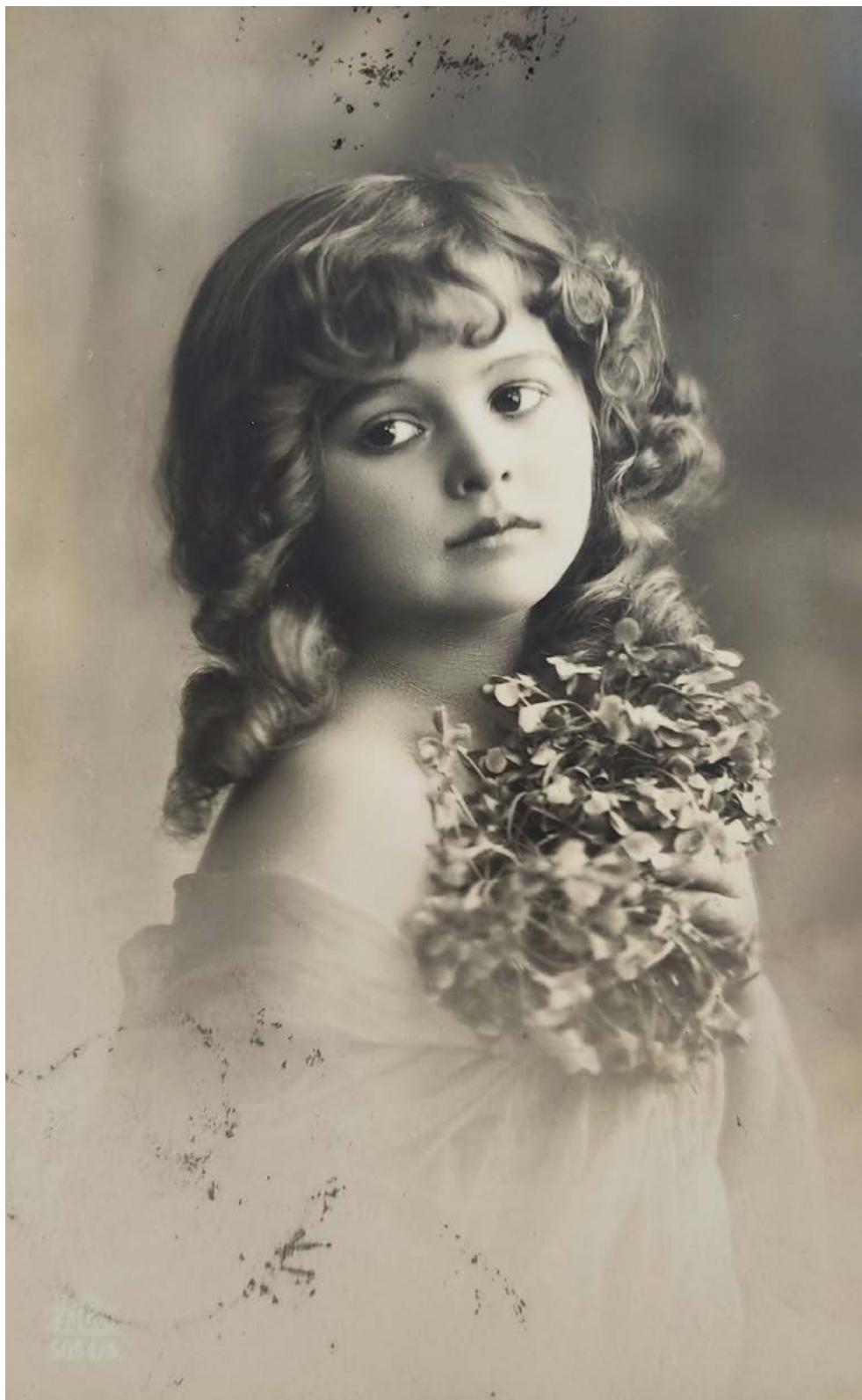
Figure 27. Girl holding violets (1909).