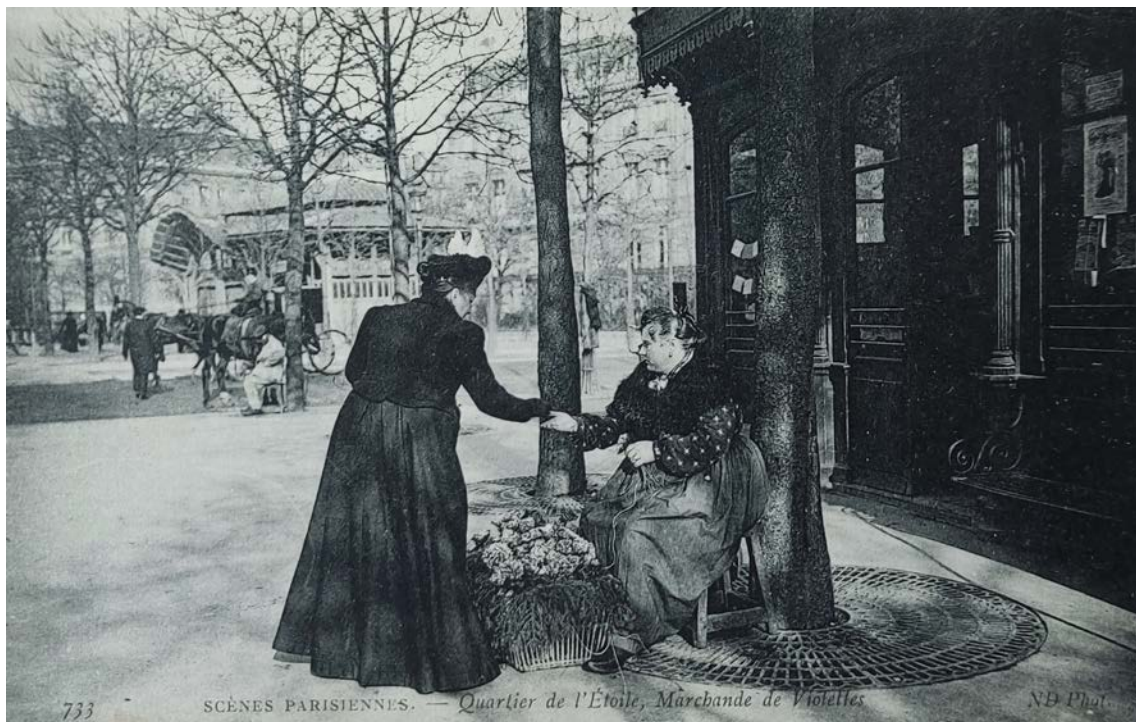
Figure 9. Violet sellers in Paris, ' Scènes Parisiennes – Quartier de l'Étoile: Marchande de Violettes ' (1905).

At the Côte d'Azur, Parma violets were cultivated as a secondary crop, in olive orchards (Figure 10), or as a main crop in open fields with partial shade (Figure 11). These violets fulfilled the demand of bouquets by the growing number of visitors, who followed Queen Victoria when she decided to spend part of the summer at the French Riviera, after visiting Menton in 1882 (Nelson, 2007). By the end of the century, a disease affected Côte d'Azur's Parma violets, and flower growers began to cultivate Viola odorata L. cv 'Victoria' instead (Perfect 1996, Nanneli 2001).