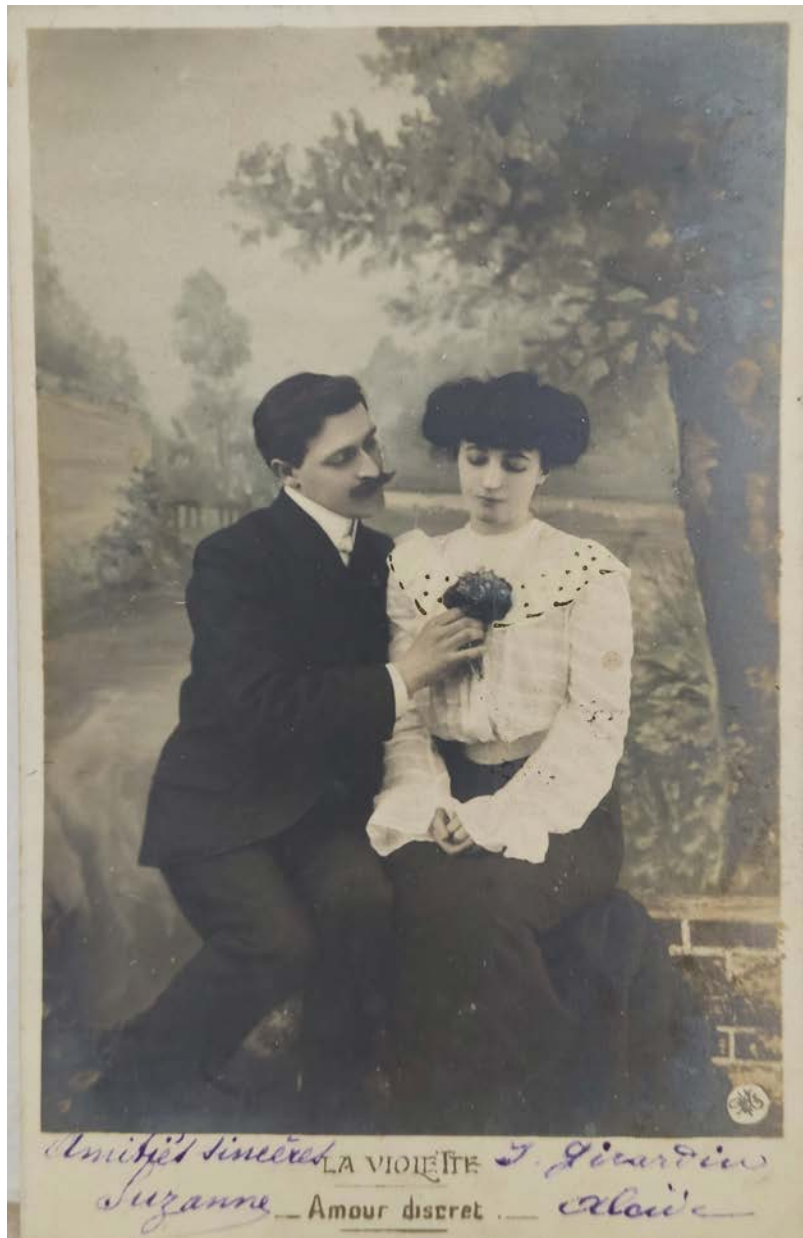
Figure 2. Violets as a symbol of discreet love (1905).