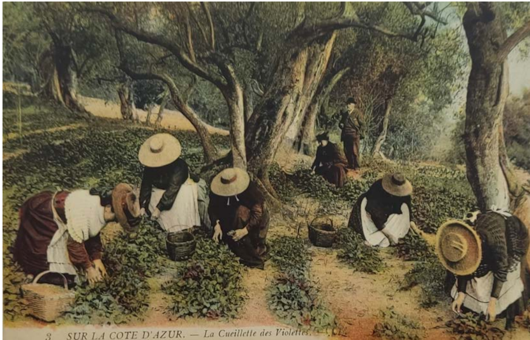
Figure 10. Picking violets in olive groves, Côte de d'Azur (c.1910).