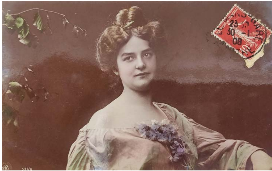
Figure 28. Violets' corsage (1908).

Nowadays, violets and Parma violets are rarely traded and many old cultivars, once very popular, are now lost.