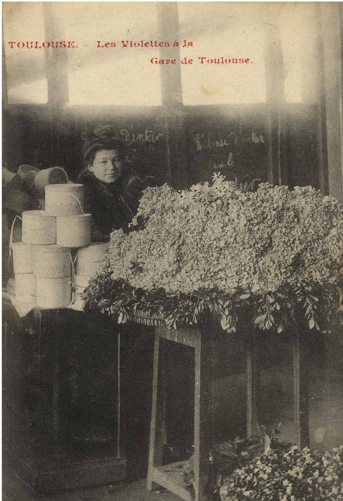
Figure 13. Selling bouquets and boxes of violets in the train station of Toulouse (c. 1910).