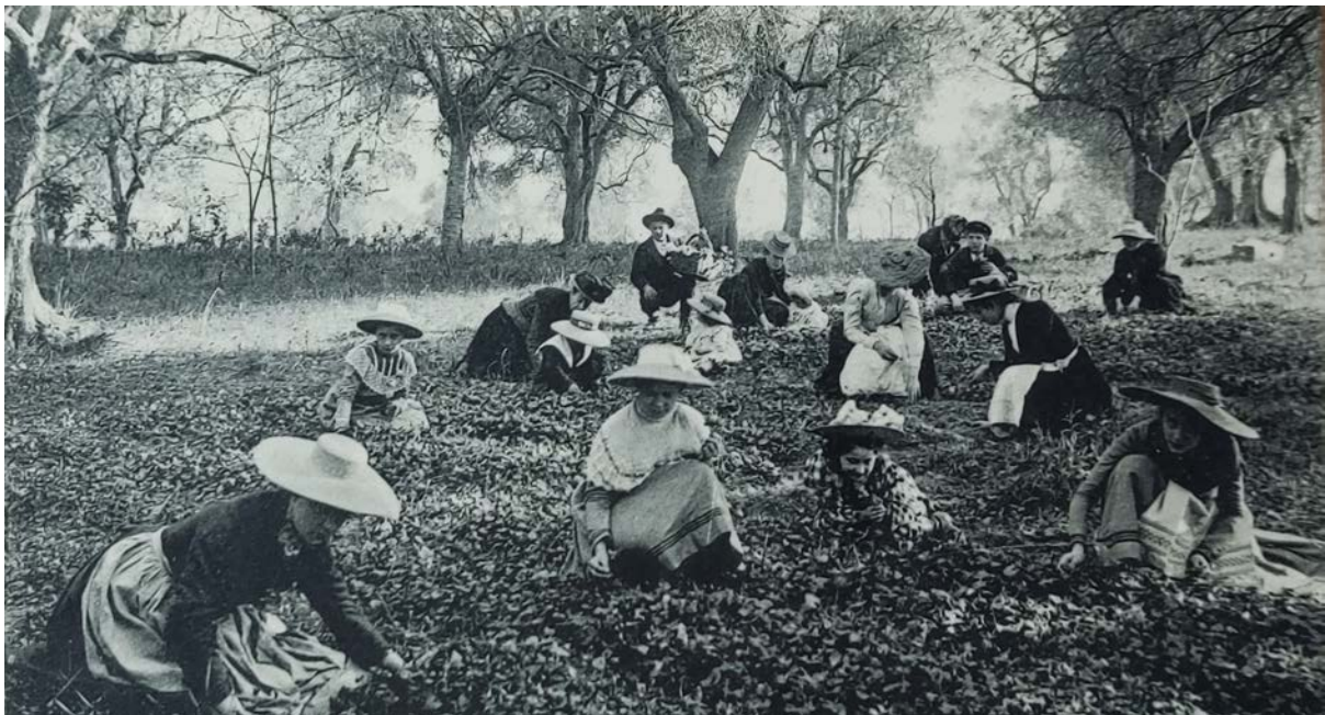
Figure 15. Picking violets in South France (Provence) (c. 1910).