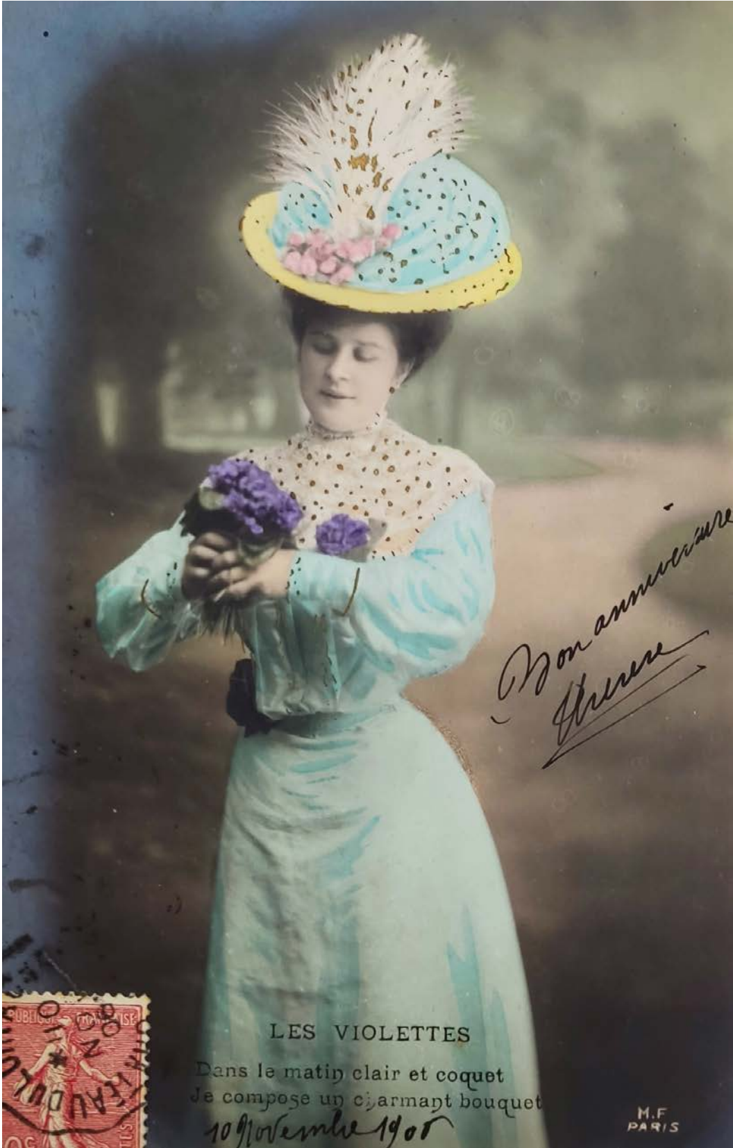
Figure 25. Woman holding several bouquets of violets (1908).