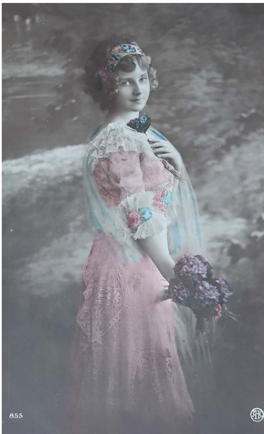
Figure 23. Woman holding several bouquets of violets (c. 1910).