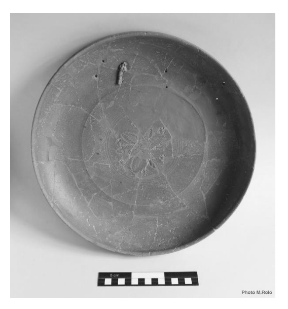
Fig. 6 – Patterns of imported ceramics in Rua Infante D. Henrique nº 58-60, the city of Ossonoba , nowadays Faro (Martins, 2019; graphic by Ana Martins)

Fig. 5 - African terra sigillata dish Hayes 61A collected in Carrão (Elvas), MBCB ARQ 1507 (Rolo, 2018, I: 356; III, Est. 128)