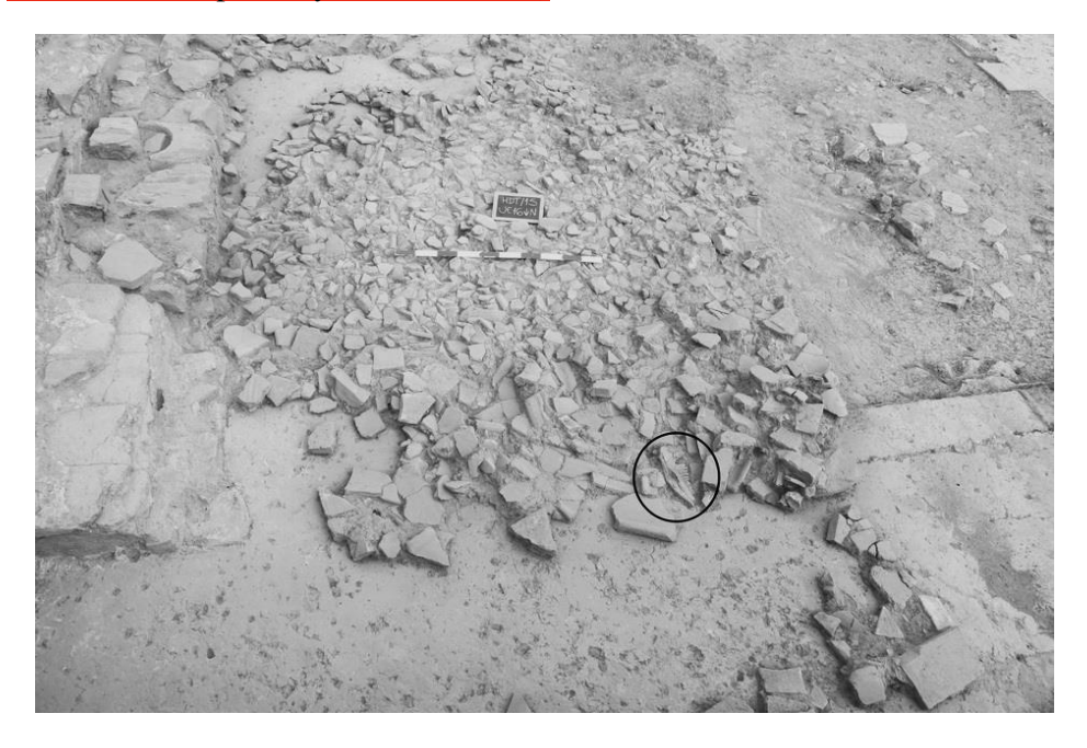
Fig. 4 – Trefoil rim jar collected in the necropolis of Torre das Arcas (Elvas), grave 68, inventory MBCB ARQ 2421 (Rolo, 2018 I: 237)

Fig. 3 – Late Antique dumping area with jawbone in [UE16] in the small peristyle, Horta da Torre