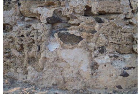
Fig. 9- External plasters

cohesion. The mortar aggregate consists mainly of quartz and feldspar crystals, and andesitic clasts with variable size that in the bedding mortars arrive to about 15 mm. Binder/aggregate ratio of ashlar bedding mortars sampled is variable (range: 0,3-0,7). In the plaster the binder/aggregate ratio is approximately 0,4-0,8.