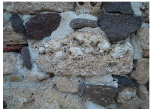
Fig. 11- Restoration Portland cement