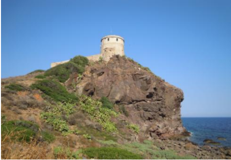
Fig. 1- The Coltellazzo tower

techniques for mineralogic-petrographic and physical characterization. This article also contains geological and geomorphological information of area's building construction and the origin of the materials used.