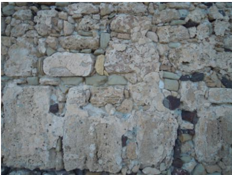
Fig. 5- First row of sandstone block

made through the use of a 80% of blocks of andesite with size up to 50 cm, 15% of sedimentary rocks in blocks up to 30 cm and 5% of granitoids with predominantly sub-spherical forms probably attributable to fluvial blocks. In sloping walls used lithologies are the same than the basement but there is a higher frequency of use of sandstone (80% of the blocks) 15% volcanic rock and a 5% of granitoids. It should be specified that in the sloping walls there is the presence of a first row (fig. 5) of square and worked sandstone blocks (side about 40 cm) coming probably from the dismantling of an earlier building in the neighboring area of Nora. Over the first row until the light room instead it detects a chaotic presence of irregular stone blocks dimensionally and unworked whose size is about 1/5 of the sandstone blocks of the first row (fig. 6).