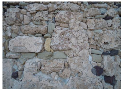
Fig. 10- Residual plasters