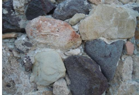
Fig. 6- Andesites, granitoid rocks and sandstones in a external wall

materials. For example, are used for cavea of the Roman theatre of Nora (Melis and Columbu, 1998), near to the tower, extracting from volcanic structure of "Su Casteddu", north of Pula city.