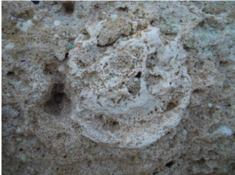
Fig. 7- Macrofossils in tyrrhenian sandstones

feldspar and quartz. This rock is present in the high mountains northwest of Nora and belongs to the Hercynian basement. It arrives in the territory of Nora through some major rivers like Rio Pula and Rio Piscinamanna. The granitoid rocks, when not altered, have a low porosity (<10%).