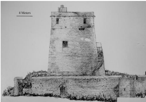
Fig. 2- Coltellazzo tower's perspective