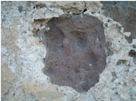
Fig. 8- Andesitic stones into bedding mortars

Original mortars in Coltellazzo tower are difficult to identify because of the massive presence of modern mortars used in recent restoration. In addition to Portland cement (Fig. 11) were used at least 3 types of modern restoration mortars. However the original mortars were sampled and divided into three main types: 1) ashlar bedding mortars (Fig. 8), 2) arriccio/rinzaffo layer plasters, 3) finiture layer plasters (Fig. 9). All the mortars have exclusively a binder with lime composition with occasionally presence of lime-lumps. However, the mortars show a medium-high degree of