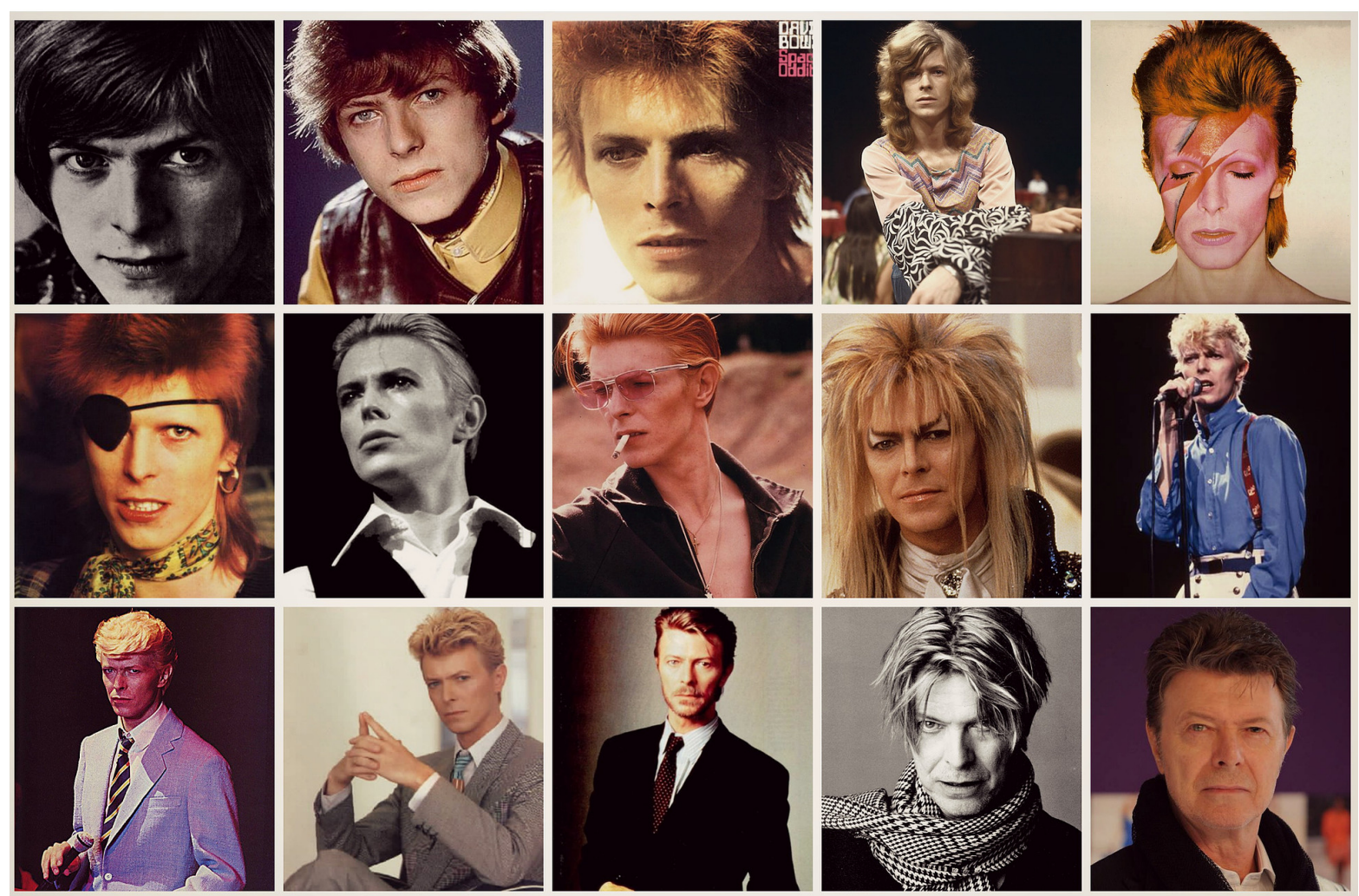
The Many Personae of David Bowie.