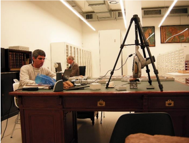
Figure 3: pXRF examination of clay cuneiform tablets from Babylon at the Vorderasiatisches Museum, Berlin in 2011.