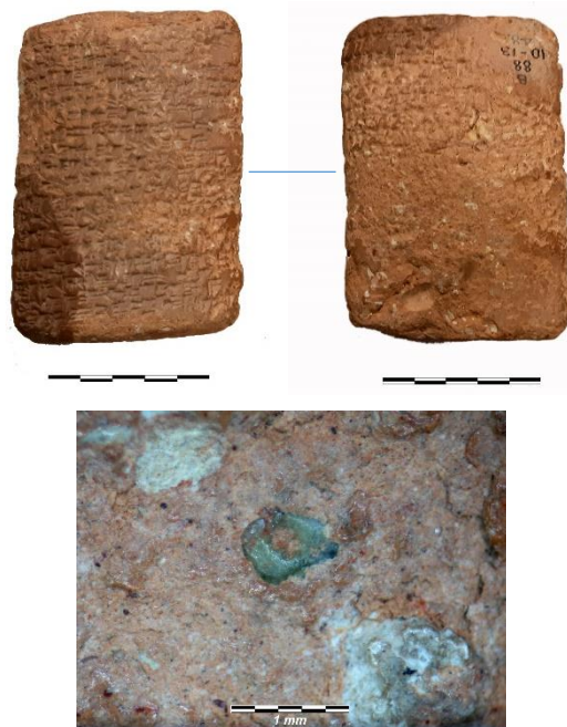
Figure 6: Tablet EA 37 from el Amarna, a letter from the King of Alashiya to the Amenophis IV of Egypt. Bottom: Stereomicroscope view of an epidote grain in EA 37.

Pachna and Moni formations and clays developed on the pillow-lava and dolerite units of the Troodos ophiolite. These included typical detrital minerals and rock fragments, such as plagiogranite, micro-gabbro, dolerite, greywacke and epidote. Such features are known also from studies conducted on Cypriote ceramics (e.g., Boness et al. 2015 with references). Although the identification of Alashiya in Cyprus on the basis of these data was broadly accepted, a minority still rejects it (Merrilees 2005).