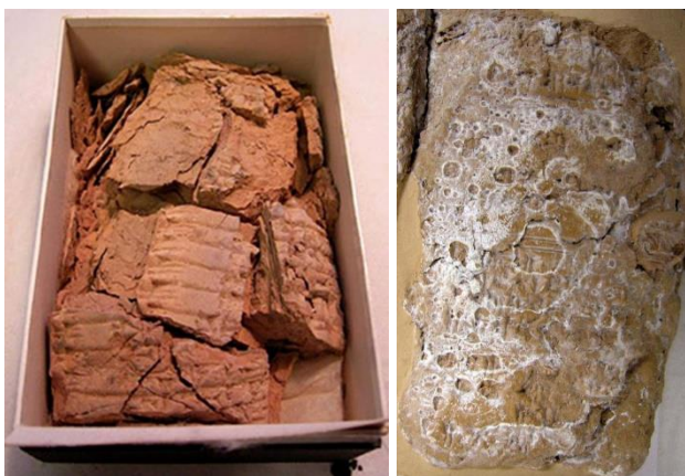
Figure 7: Examples of degradation of tablets in the British Museum. Left: crumbling. Right: salinization.

The ongoing analytical study of cuneiform tablets, a research project enduring for quarter of a century now, is representative of many problems occurring in modern heritage science. Over the years, the constant introduction of novel and innovative analytical methods has constantly broadened our scope, enabling the investigation of an increasing number of questions. From merely provenance study using the conventional methods of petrography and INAA, this project shifted to specific branches such as the firing of Egyptian letters, dating selected texts from Boğazköy-Ḫattuša or the use of one mineral to further disclose location of Alashiya. With the advent of new apparatus offering better NDT or MDT of sensitive heritage objects such as tablets, there seems to be an endless choice of possibilities.