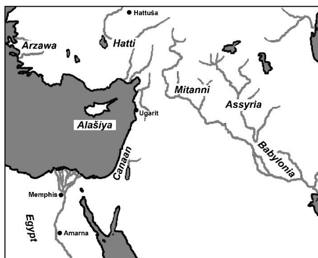
Figure 1: Map of the ancient Near East during the 2nd millennium BC with sites mentioned in the text

a significant part was aimed at achieving proficiency, first in the very writing and reading of the cuneiform script, and secondly, in the knowledge of magic, medicine and the art of divination. This immense body of textual materials became widespread from Mesopotamia to be received in places far and wide—from Susa in Iran to Ugarit on the Syrian coast, and in culturally diverse centers, such as Hittite Anatolia or Pharaonic Egypt. These cultural interactions acted, throughout long and complex transmission processes, as agents of intercultural interactions. Hence, the “Cuneiform Culture” as it is often referred to, can be seen as the only source at hand of the wisdom, literacy and intellectual creation of the cradle of civilization.