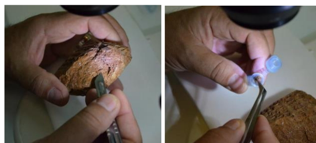
Figure 2: Sampling a tablet from Emar in the Bible Lands Museum, Jerusalem, using MDT method

see Goren et al. 2004: 4-22, 2007, 2011; Mommsen 2004). These studies have also shown two methodological rules: first, that cuneiform tablets were not always produced of the same clay types as the local pottery; hence they should be treated separately from other archaeological ceramics. Secondly, while pottery can be often studied by the routine mineralogical and chemical methods involving intrusive sampling, clay tablets are unique and sampling, if allowed, should be much below the standards of the regular petrographic and elemental examination procedures. Therefore, together with the application of MDT sampling techniques (Goren et al. 2004: 4-12), the main effort was directed to the development of new methodologies, with the support of NDT apparatus.