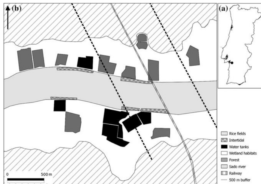
Fig. 11.1 Map of the study area in the Sado Estuary (Portugal), showing the location of the sectors close to (0–500 m) and far from (500–1500 m) the railway, where wetland birds were counted between December 2012 and October 2015

thus minimizing double counts (Bibby et al. 2005). We did not carry out counts on days with adverse weather conditions, such as heavy rain and strong winds.